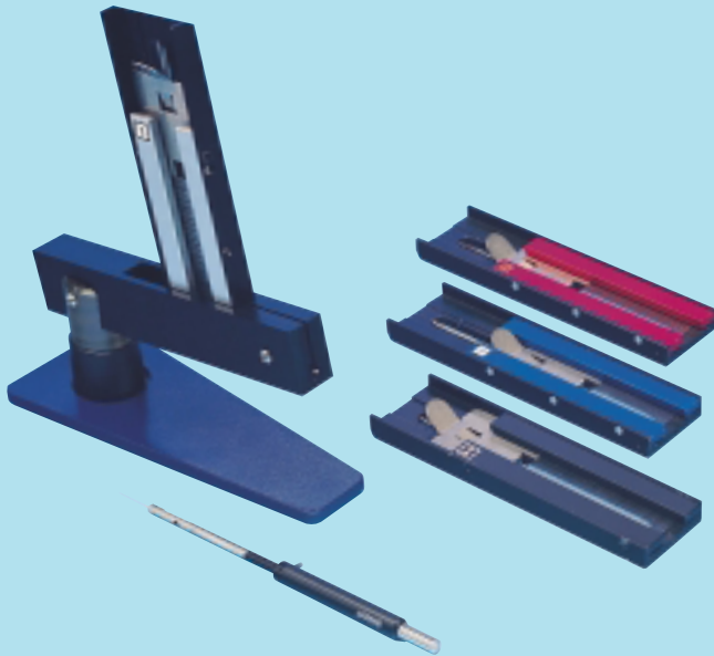
∅ Capillary Dispenser, Universal Capillary Holder, Dispenser Magazines