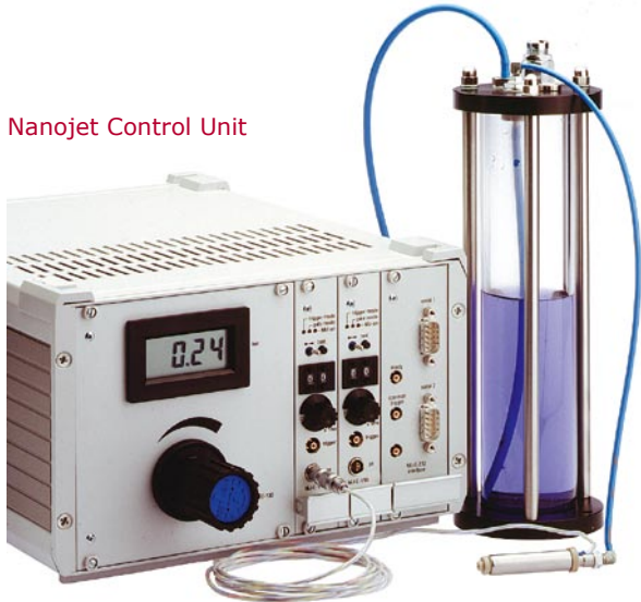
Nanojet Control Unit