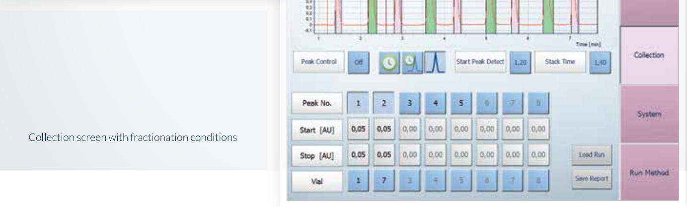
Collection screen with fractionation conditions