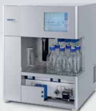
PREP SFC 100