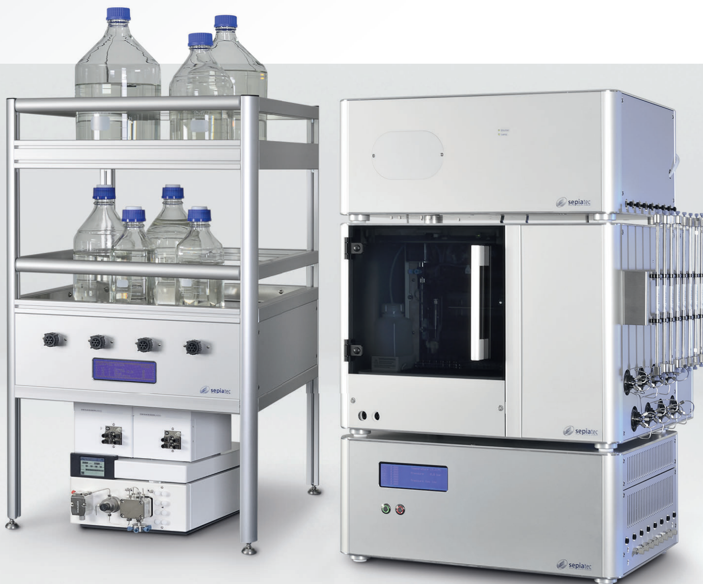
Sepmatix 8x System Screening HPLC with Eluent Rack

The Sepmatix 8x System Screening HPLC can separate substances on eight different separation columns simultaneously. This significantly increases sample throughput.